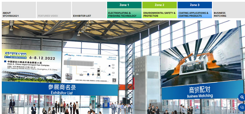
Figure 2: The "Lobby" page of SFCHINA2021 Online Show.