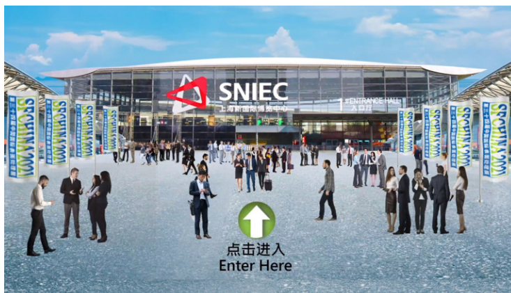
Figure 1: The landing page of SFCHINA2021 Online Show.

The 2021 exhibition will continue to be staged online at www.sfchinaonline.net , which is already live and will stay open until March 15, where visitors can continue visiting over 190 exhibitors online. From March 2 onwards (original opening date of the Physical Show), visitors can also watch live or pre-recorded videos such as Editor's Recommendations and Featured Videos prepared by industry experts, professors and exhibitors, etc. Registered visitors of our Physical Show should have received an email from us to login to the Online Show directly, without having to go through the registration process. If you have not registered to visit before, please register now to start browsing our Online Show right away!